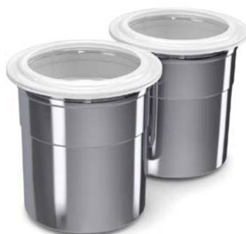
2 Chrome steel cups with sealing cap