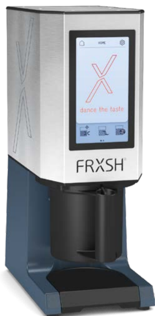
FRXSH Mousse Chef with protective beaker